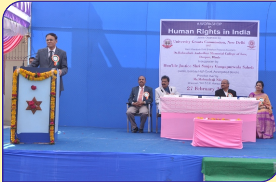
Hon'ble Justice Shri. Sanjay Gangapurwala Saheb addressing the participants in Human Rights Workshop