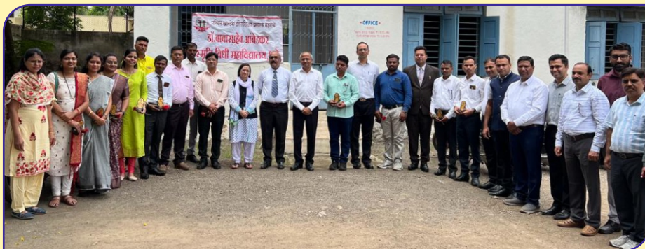
Felicitation Group photo with 17 of our college alumni appointed as APP