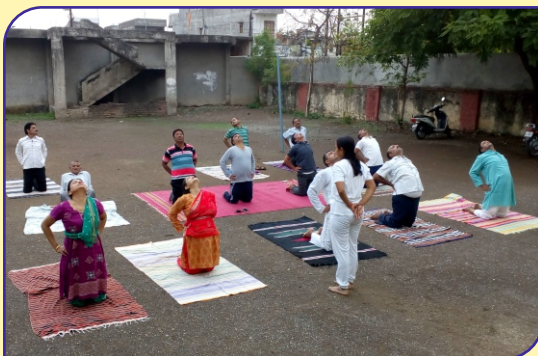
Teaching and Non-teaching Staff participated in 'Yoga Day'