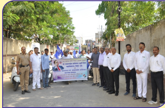
Birth Anniversary of Dr. Babasaheb Ambedkar 14 th April, College organized a bike rally